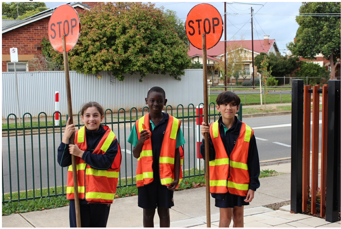
Thank you to these students who have volunteered to be crossing monitors: