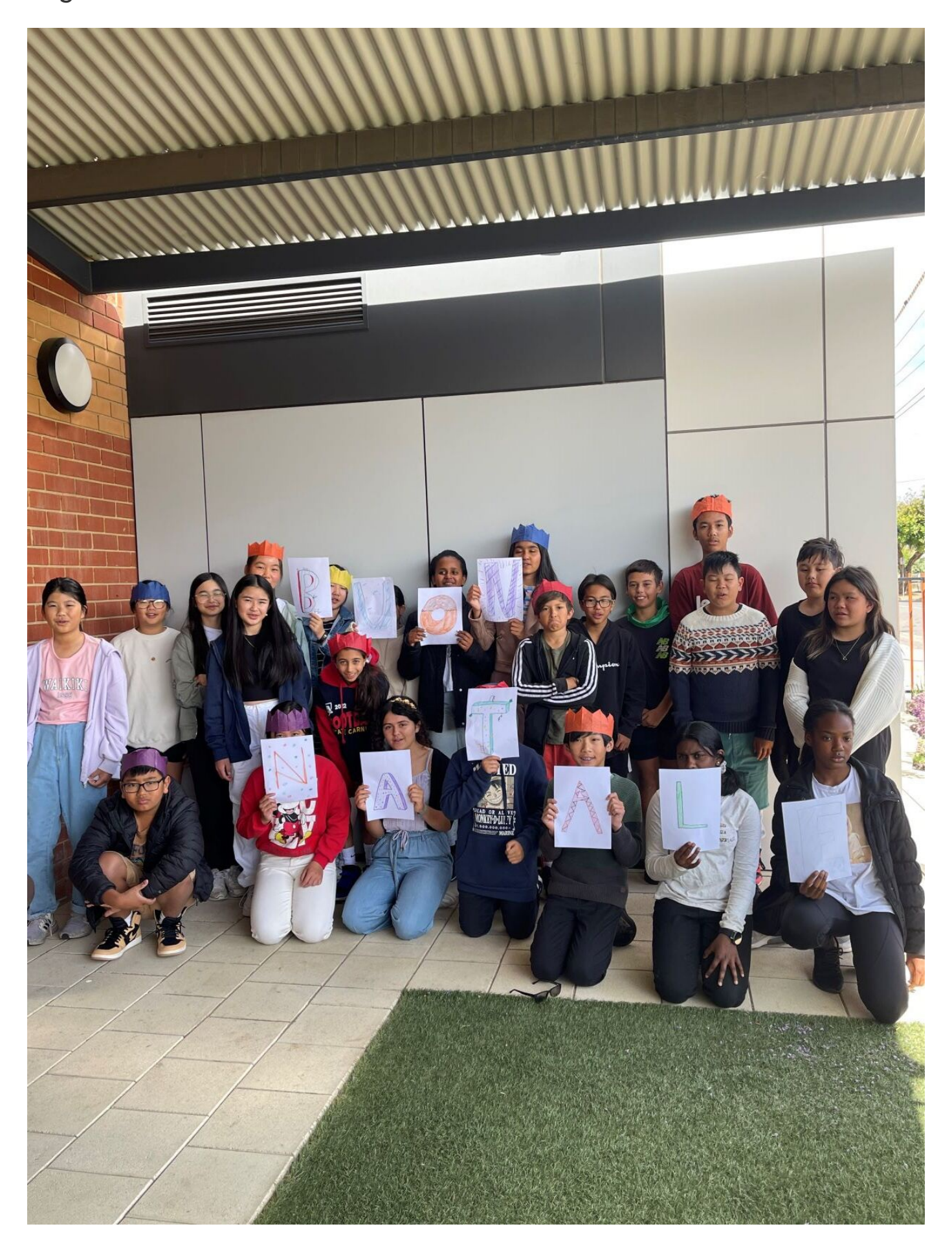
Buon Natale a tutti! Merry Christmas to all.