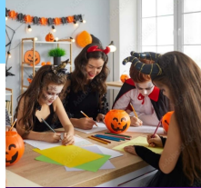
Base Camp Day

Visit campaustralia.com.au/rocketeers to join our next mission Camp Australia