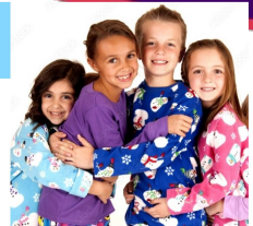
Base Camp Day