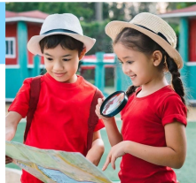
Experience Takeover Incursion

Full Fee $111.50 | After Max. CCS* $11.15