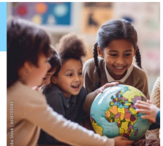
Base Camp Day