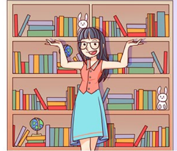
The school redeems Scholastic Rewards for additional resources