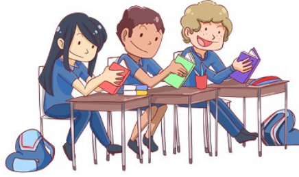
The school earns Scholastic Rewards.