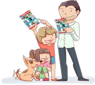
Families order from Book Club.

Every purchase you make earns your child's school 15% of your order value in Scholastic Rewards that can be used to purchase valuable educational resources that benefit your child.