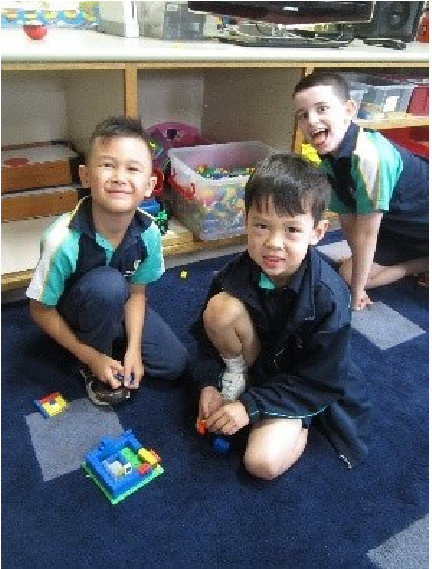
Students are having loads of fun at OSHC before and after school.