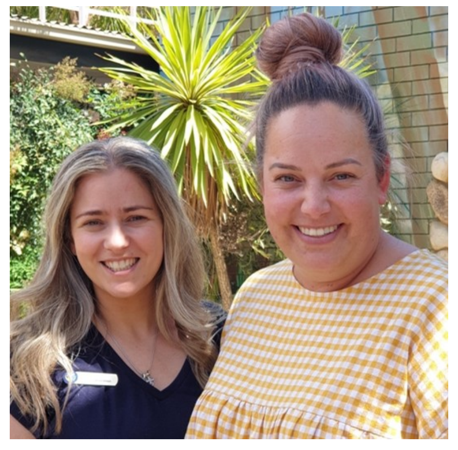
Group 1: Monday & Tuesday 8.45am - 2.45pm;